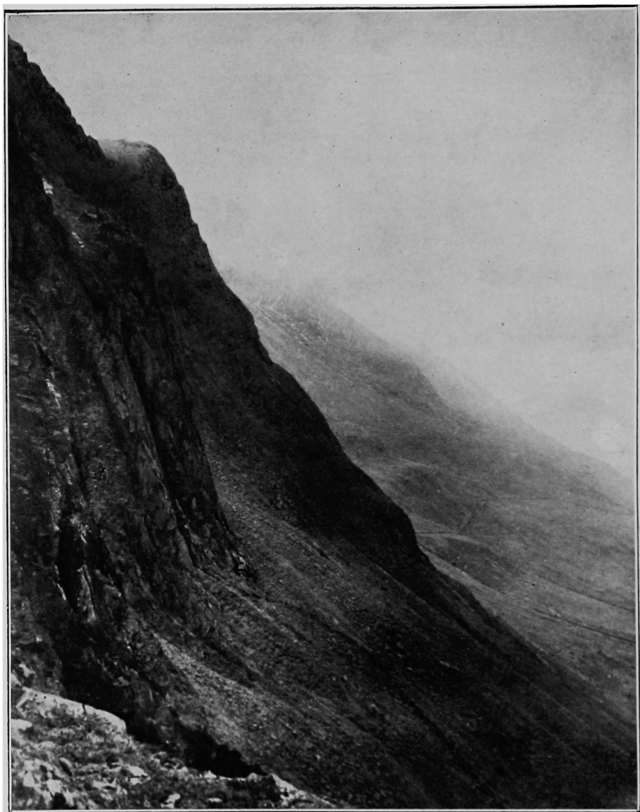
THE HAYSTACKS; FROM GREEN CRAG.